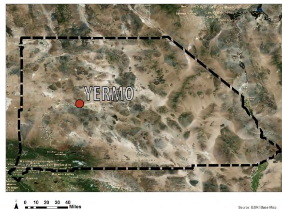
Figure 1: Yermo Area Map