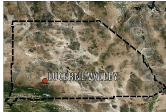
Figure 1: Area Map

Lucerne Valley is located in the southwest desert of San Bernardino County. The area mostly comprises flat plains and the foothills just north of the San Bernardino National Forest and Big Bear Lake. The nearest city is Apple Valley to the west.